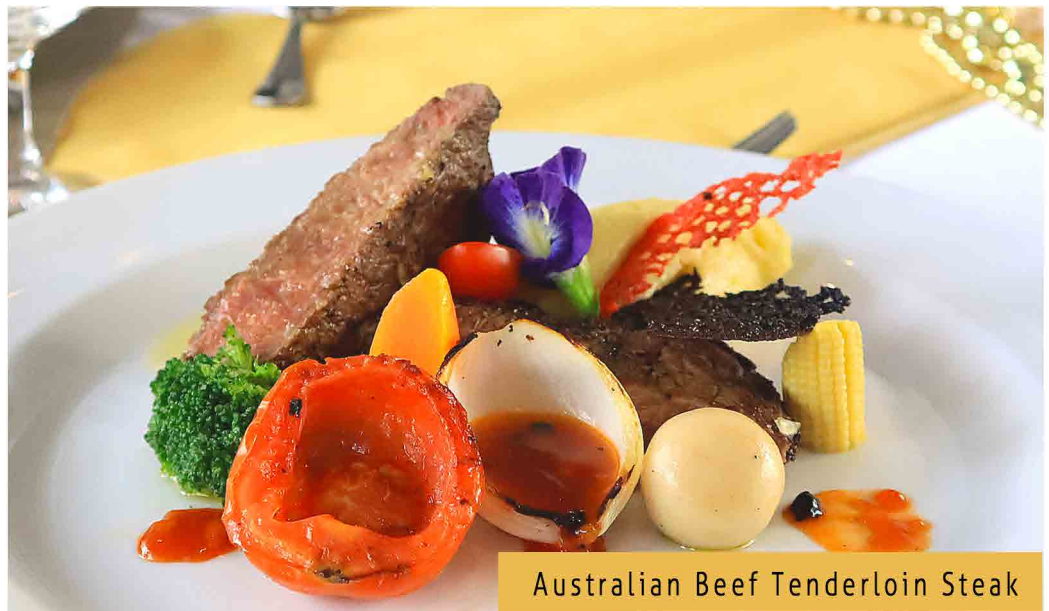
Australian Beef Tenderloin Steak