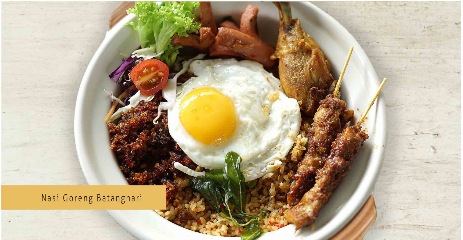
Nasi Goreng Batanghari